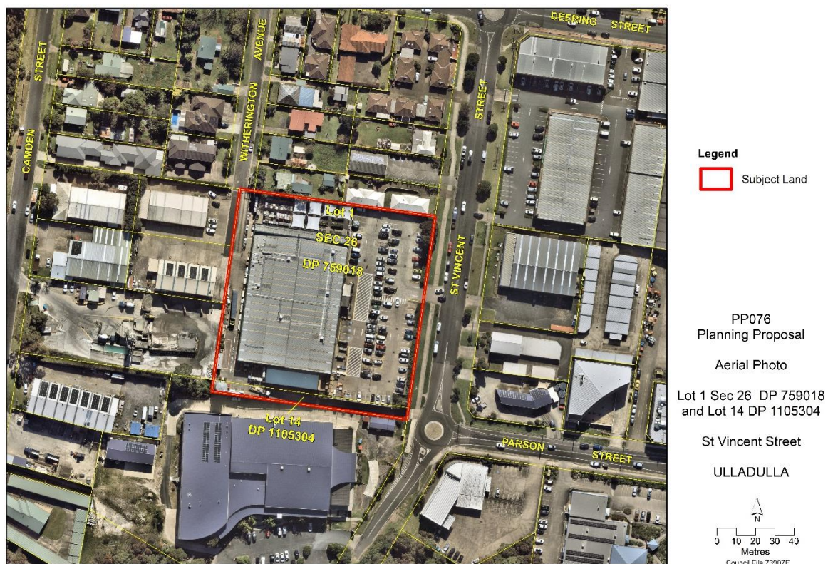
Figure 1 – Aerial photo showing the Subject Land in red outline.

This proponent-initiated Planning Proposal (PP076) affects Lot 1 Sec 26 DP 759018 and Lot 14 DP 1105304 at 131 St Vincent St, Ulladulla (the subject land) where an existing Bunnings Warehouse is currently located - see Figure 1 . Note: Bunnings Warehouse will relocate to a new approved site in due course.